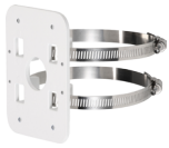
PFA152 Pole mount